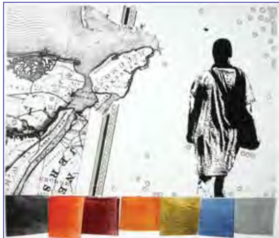
Image: Ayse Balyemez, Walking Around , float glass, pigment, 10" x 12" x 1", 2011