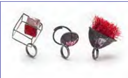
Image: Myung Urso, Memory Rings , silk, Oriental ink, thread, silver, lacquer, 2010