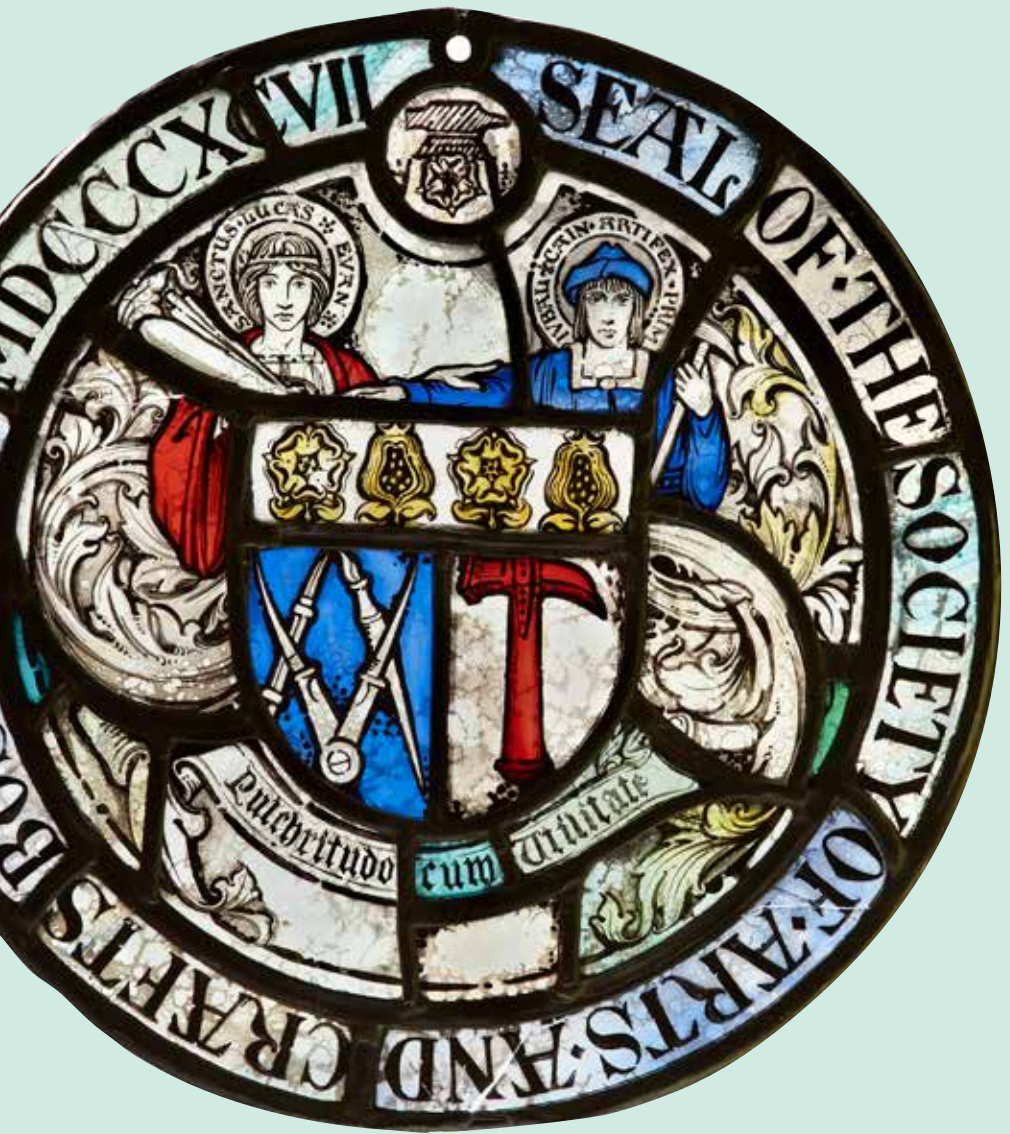
Stained Glass Seal of the Society of Arts and Crafts