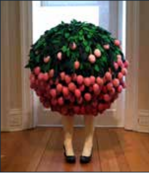
Floral Fictions Installation